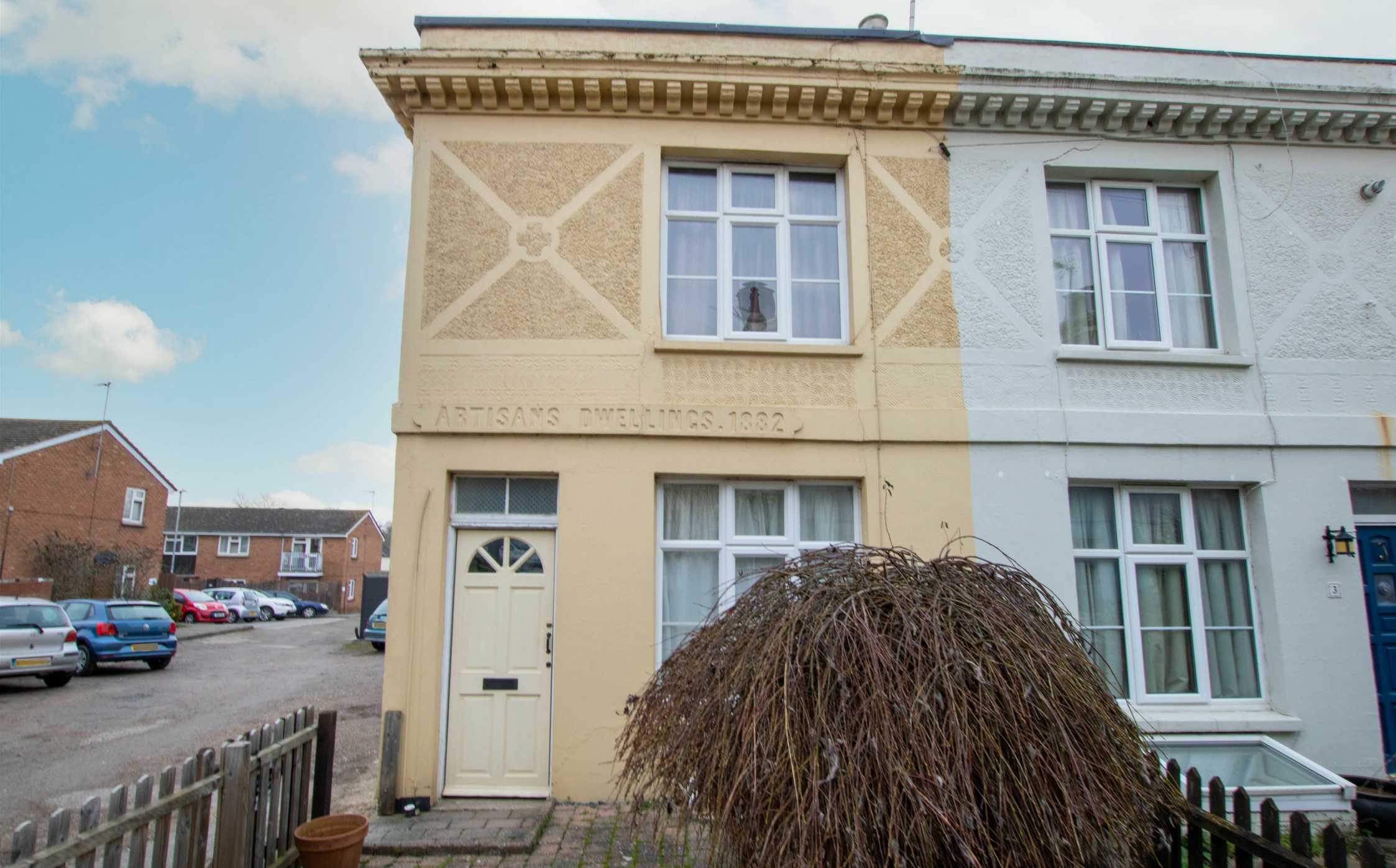
Artisans Dwellings, Saffron Walden, CB10 1LW